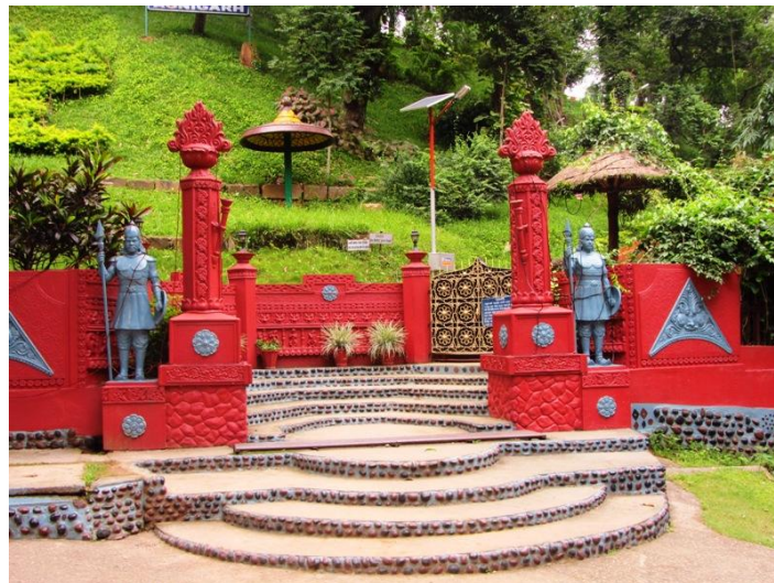
Agnigarh Hill, Tezpur

Waiting at a police check post outside District Collector's Office, my presence inspired inquisitiveness in the minds of the servicemen there. I would like to believe that my diction is good. I have been a good orator. Then why is it that whenever they asked and I answered that I am from BANGALORE, they always heard BENGAL? Anyways' apart from the numerous probing questions I got and comments that I received, a policeman, while discussing the high frequency of BOND (strikes) in Assam retorted - " India me to itna bond nahi hota. Saal me ek do din. Yahan bahut hota hai ". Here I was talking to somebody in Hindi, standing outside a building with the Tricolour on top, talking to a person whose khaki uniform had the Lion emblem, standing on my own soil. . getting to hear these words which pierced my heart . .